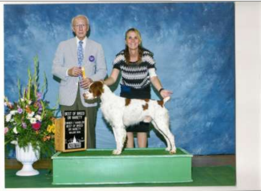
Dr Jac's Redneck Rampage O'Dee , breeder/owner handled. 2 time Best of Breed winner, major pointed.