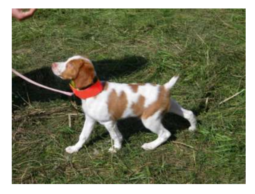
Bandit - a future Hunter participant (out of Rebe and Duffy)